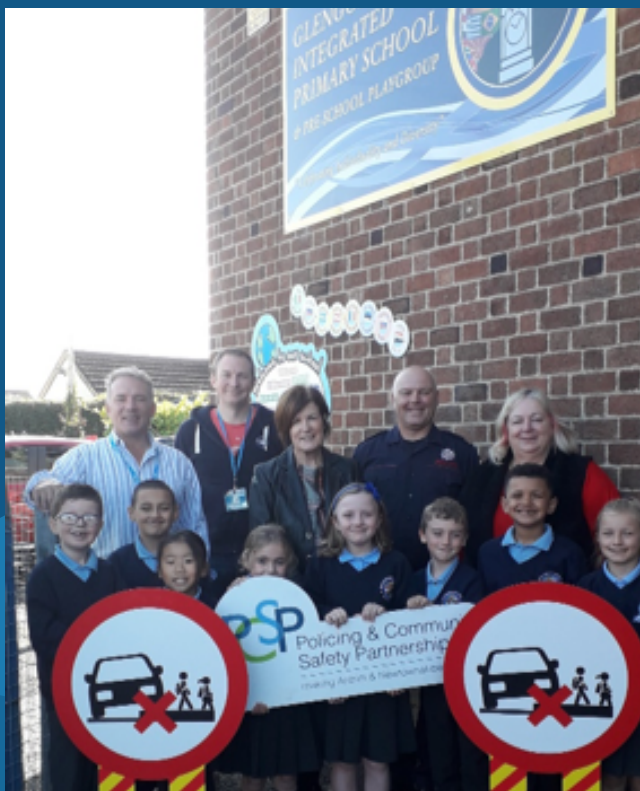
Pupils from Glengormley Integrated Primary School with Antrim & Newtownabbey PCSP members