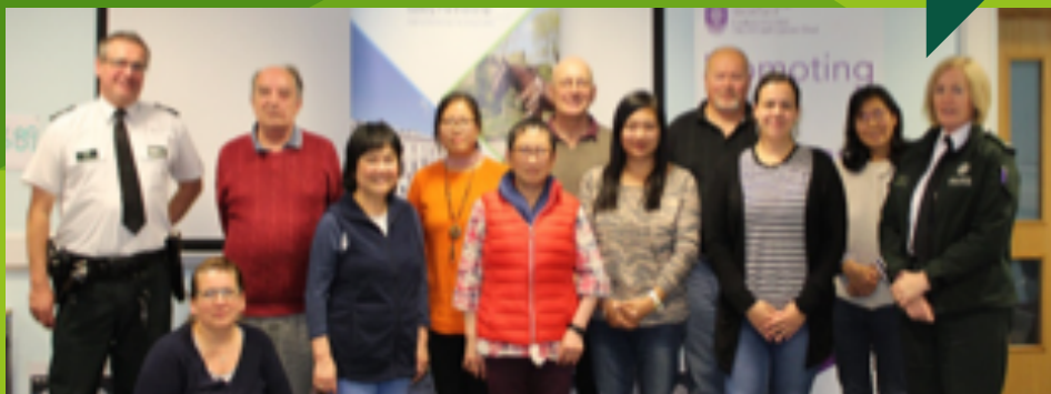
Some of the participants in the Crime Awareness event.