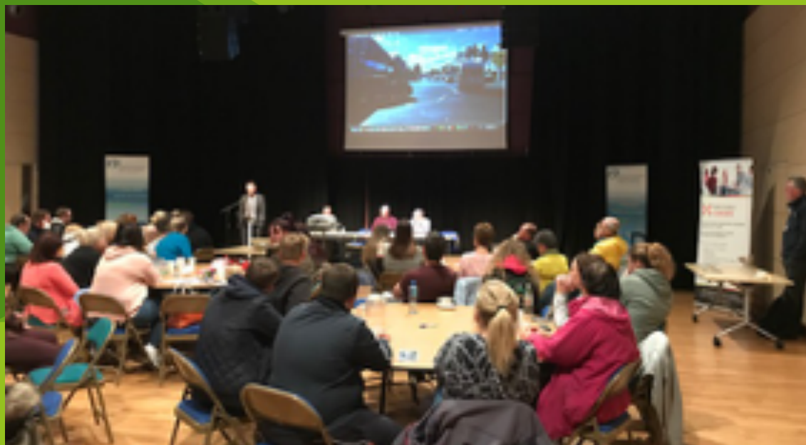
Learning all about safety