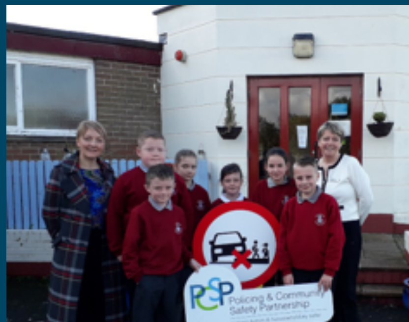
Pupils from Rathcoole Primary School are making great use of the signs