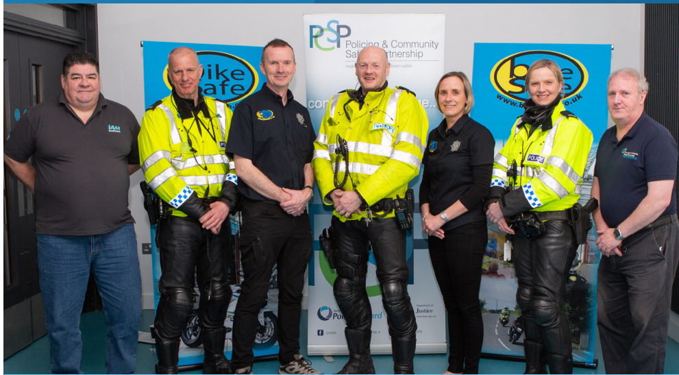
Attendees at the Bikesafe training.

The PCSP has also supported Bikesafe in partnership with PSNI and IAM Road Smart where more than 20 cyclists took part in a classroom session looking at the key aspects of motorcycle safety, followed by an on the road assessment by an advanced police motorcyclist.