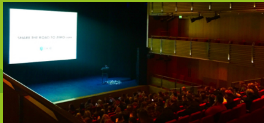
Pupils preparing for the Roadshow at The Theatre At The Mill