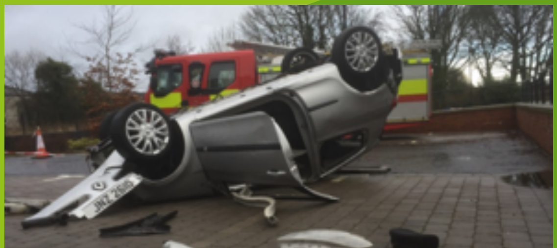
Part of the Roadshow gives pupils an idea of the chaos left behind by a road traffic collision

The Roadshow - a partnership between the PSNI, PCSP, Roadsafe NI and NIFRS - was delivered to 300 year 14 pupils. After hearing from survivors and learning more about road safety, pupils watched a full scale re-enactment of a fatal car crash, seeing the devastation caused by careless driving.