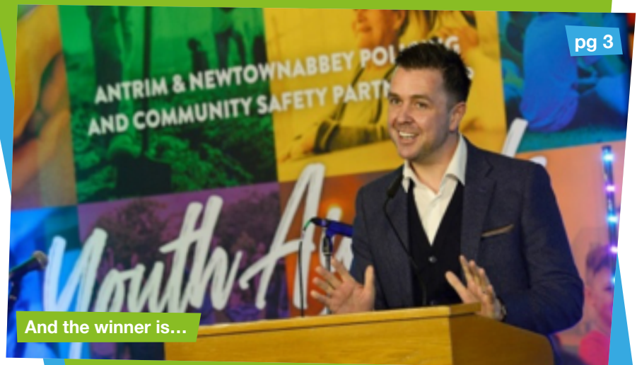
And the winner is...