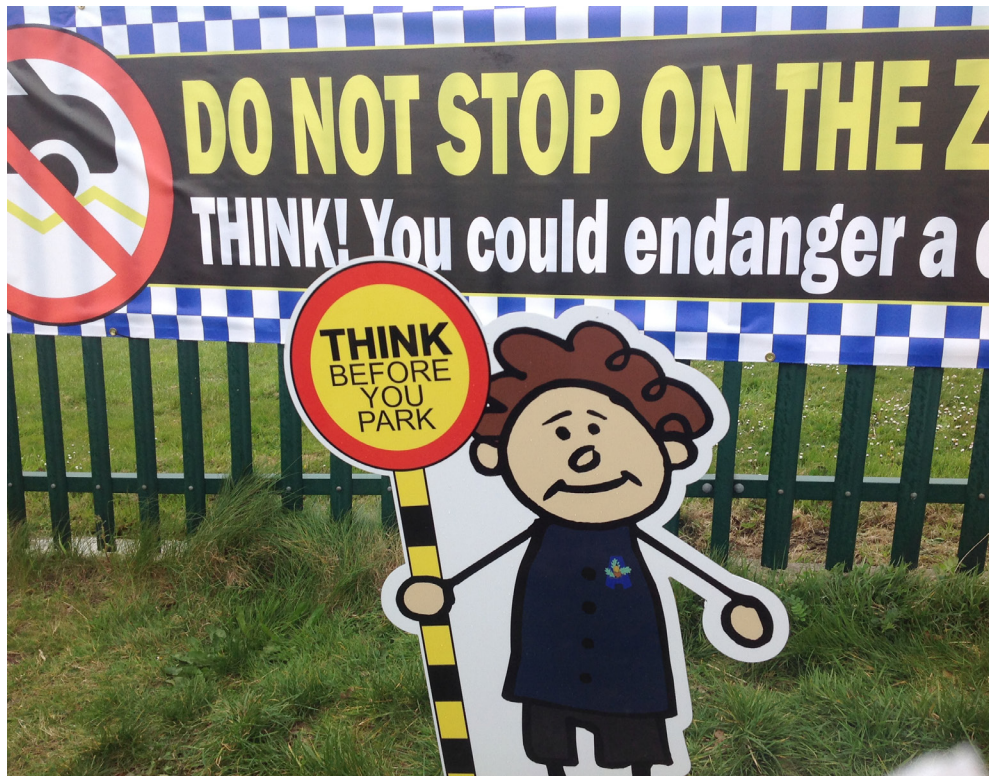
Reminders of the dangers were placed around the school