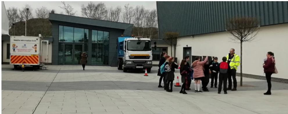
Pupils at Bee Safe 2019.