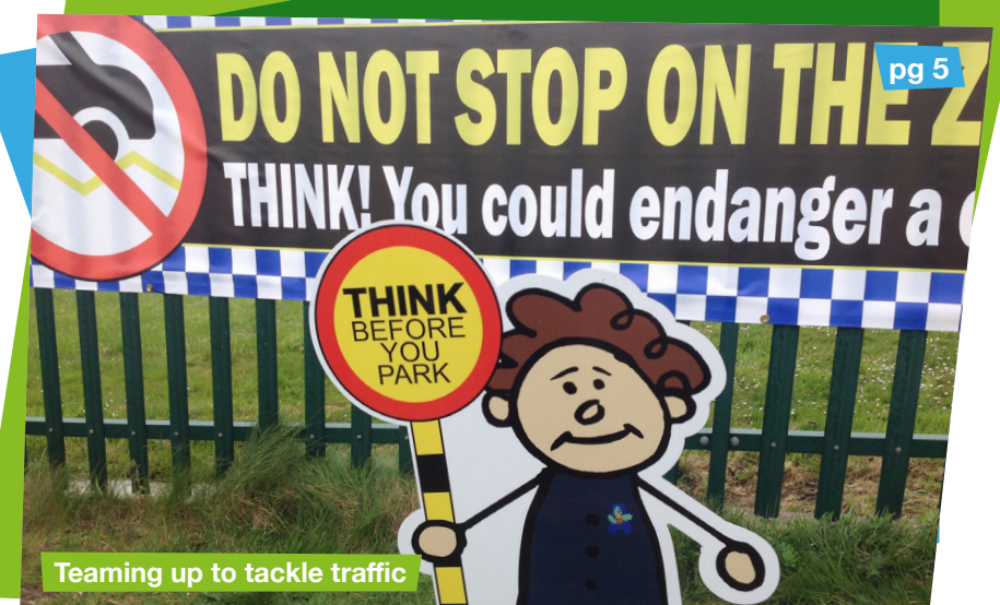
Teaming up to tackle traffic