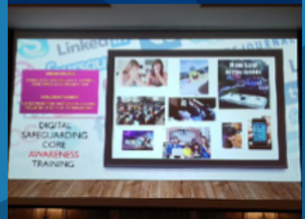
The facilitated discussion included resources for parents and children alike

To support the message, the PCSP worked with Western Digital Safeguarding Steering Group to train a Digital Safeguarding Champion for each school.