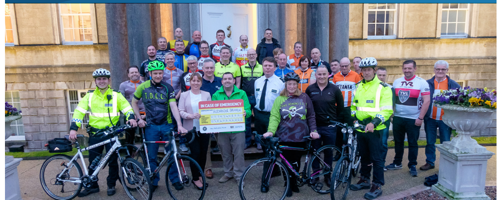
Participants in the project

The safety equipment will help the clubs work closer with the PSNI in reporting dangerous situations on the roads, as well as encouraging safer cycling. The project also provides an opportunity for clubs to engage with the PCSP and PSNI, sharing ideas for improving road safety and creating a working partnership.