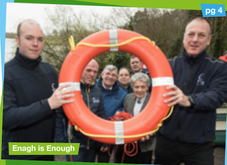
Enough is Enough