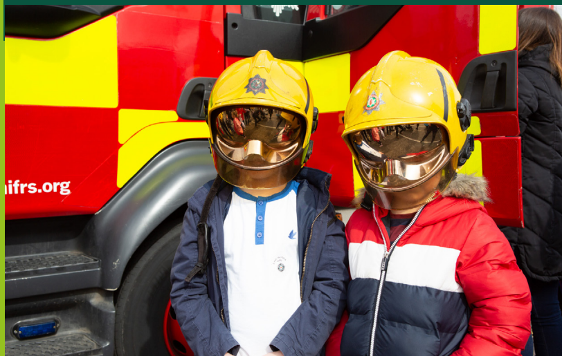
Two future firefighters get into the spirit!

"This event provided a great opportunity for the public to engage with the emergency services along with our local community organisations and advice services while having fun for free. I hope it's possible that this can happen annually."