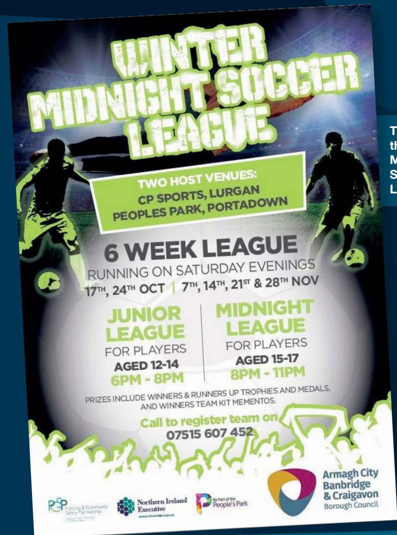
The flyer for the Winter Midnight Soccer League

It’s not too late to sign up so for more details or to register a team, please contact Nuala on 07515607452 .