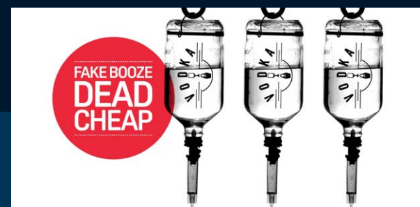
One of the messages from the Fake Booze campaign.

click here for more information on the campaign.