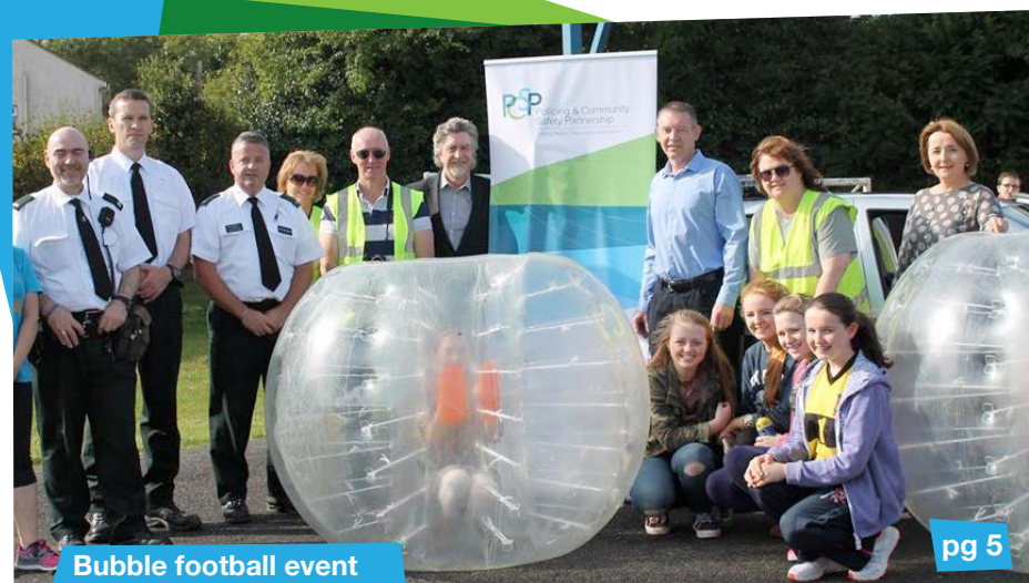
Bubble football event