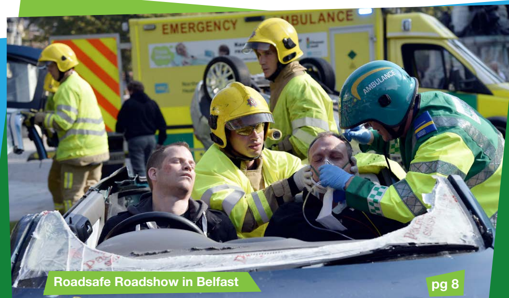
Roadsafe Roadshow in Belfast