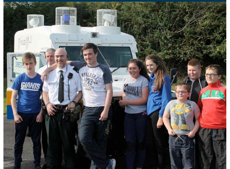
Members of the PSNI Local Policing Team with young people from the Camlough area.

Young people in the Newry, Mourne and Down area got the chance to roll around in a big ball of plastic for fun thanks to the PCSP, the PSNI and Camlough Community Association recently. The Bubble football was a diversionary activity for local young people which gave them the opportunity to engage with local police and the PCSP.