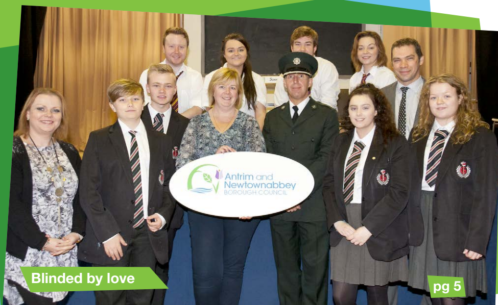
Blinded by love