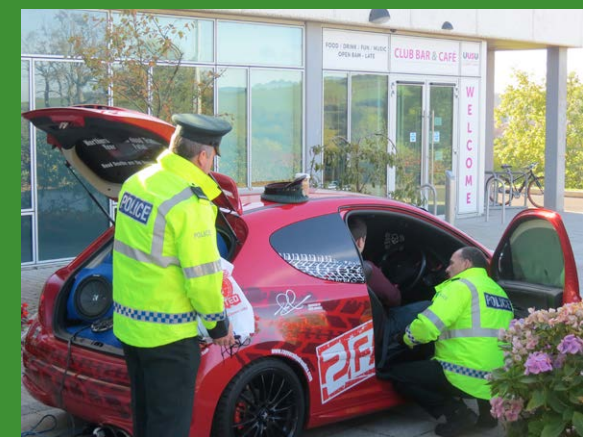
Coleraine students and PSNI Roads Policing Education Officers with the 2 Fast 2 Soon simulator car.

Further North at the University of Ulster in Coleraine, Causeway Coast and Glens PCSP worked with PSNI Roads Policing to bring the 2 Fast 2 Soon simulator car to the campus. About 200 students saw the simulator and some of these were able to get into the car itself and find out what it might be like to lose control when driving. Not a pleasant experience but one that had the students talking about the reality of being in charge of such a powerful piece of kit as a car.