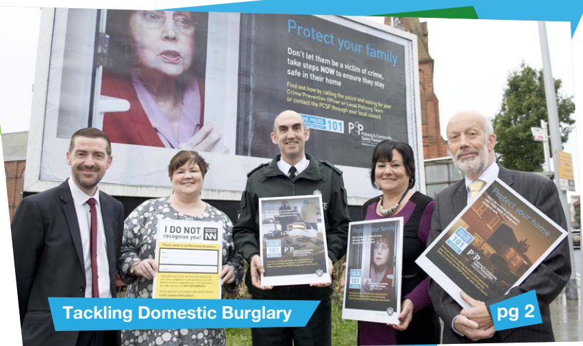
Tackling Domestic Burglary