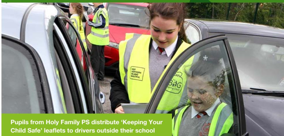
Pupils from Holy Family PS distribute ‘Keeping Your Child Safe’ leaflets to drivers outside their school

To get your hands on the advice leaflets contact the PCSP on 028 71 253 253 or pcsp@derrystrabane.com .