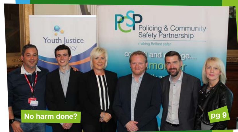
No harm done?