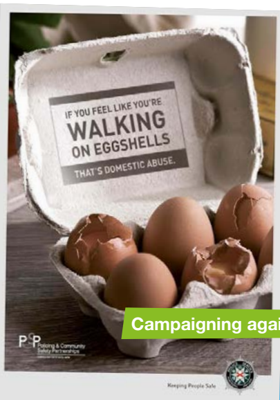
Campaigning against domestic abuse