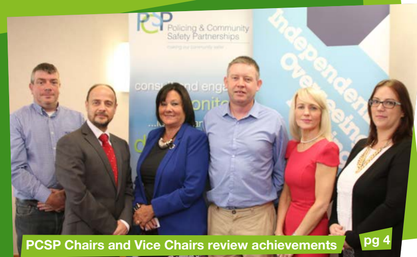
PCSP Chairs and Vice Chairs review achievements