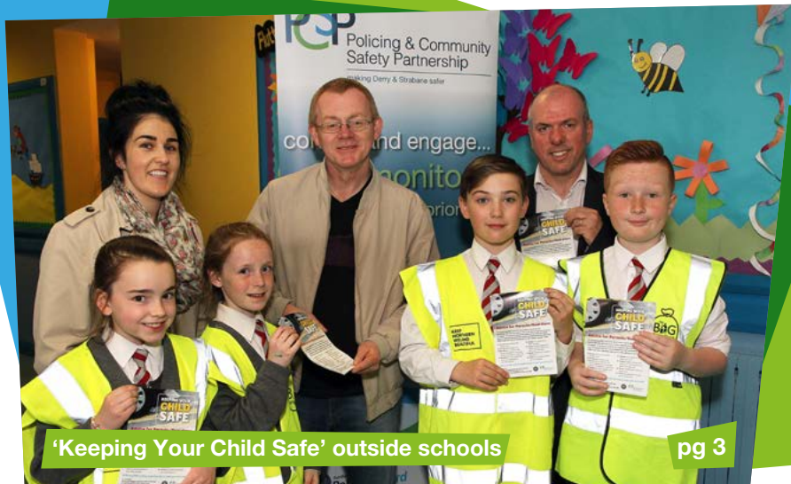
'Keeping Your Child Safe' outside schools