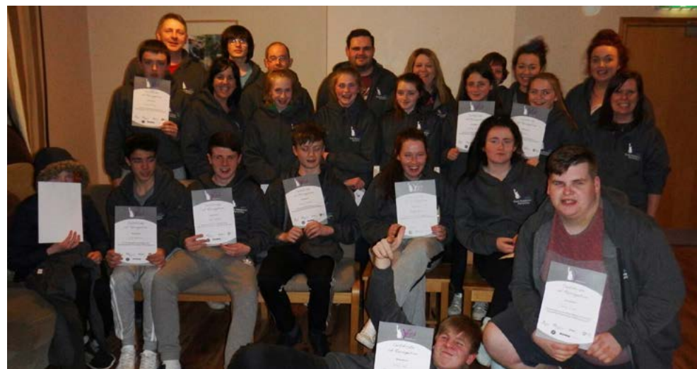
Representatives from the PCSP, PSNI, YJA and Education Authority with the participants of YEP 2016 and the Peer Mentors.

click here for more information about Breakthru