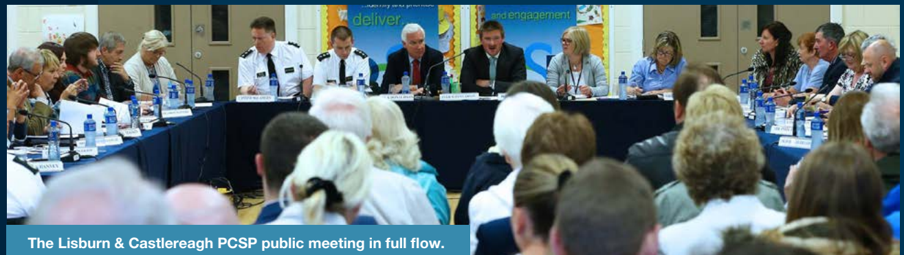
The Lisburn & Castlereagh PCSP public meeting in full flow.