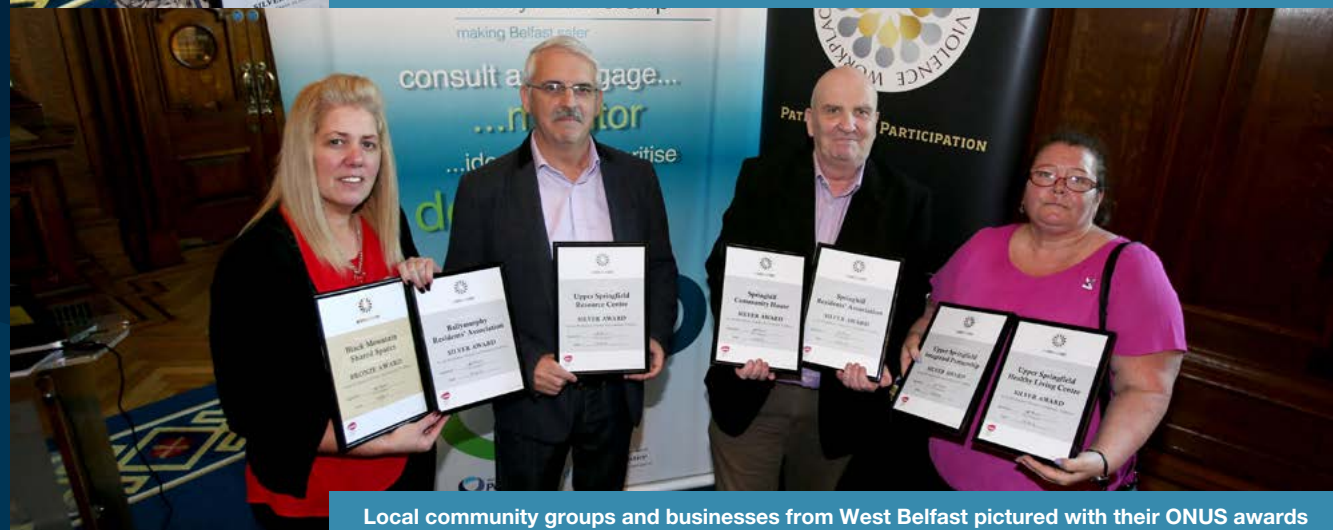
Local community groups and businesses from West Belfast pictured with their ONUS awards