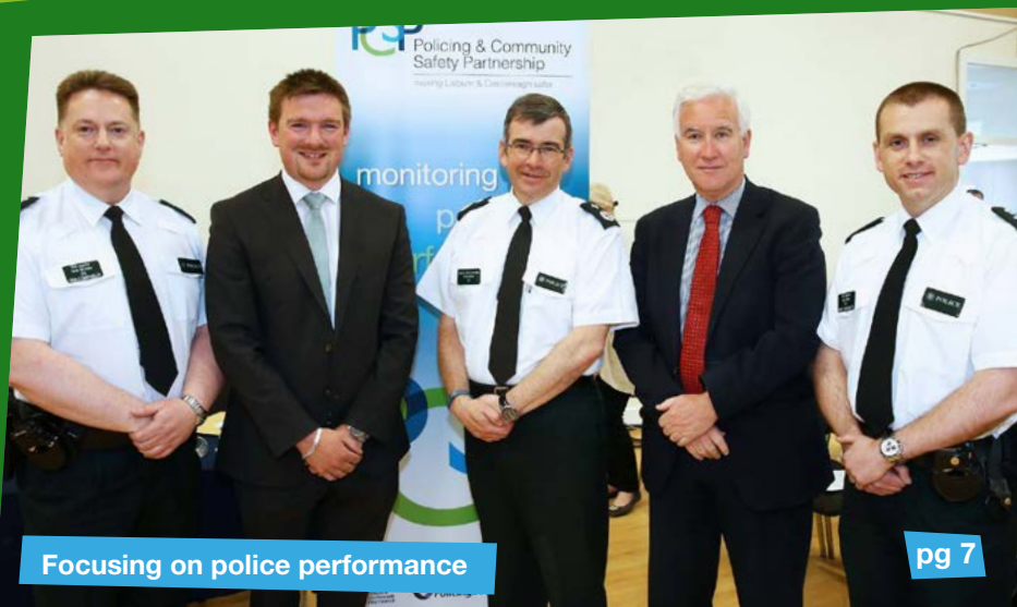
Focusing on police performance