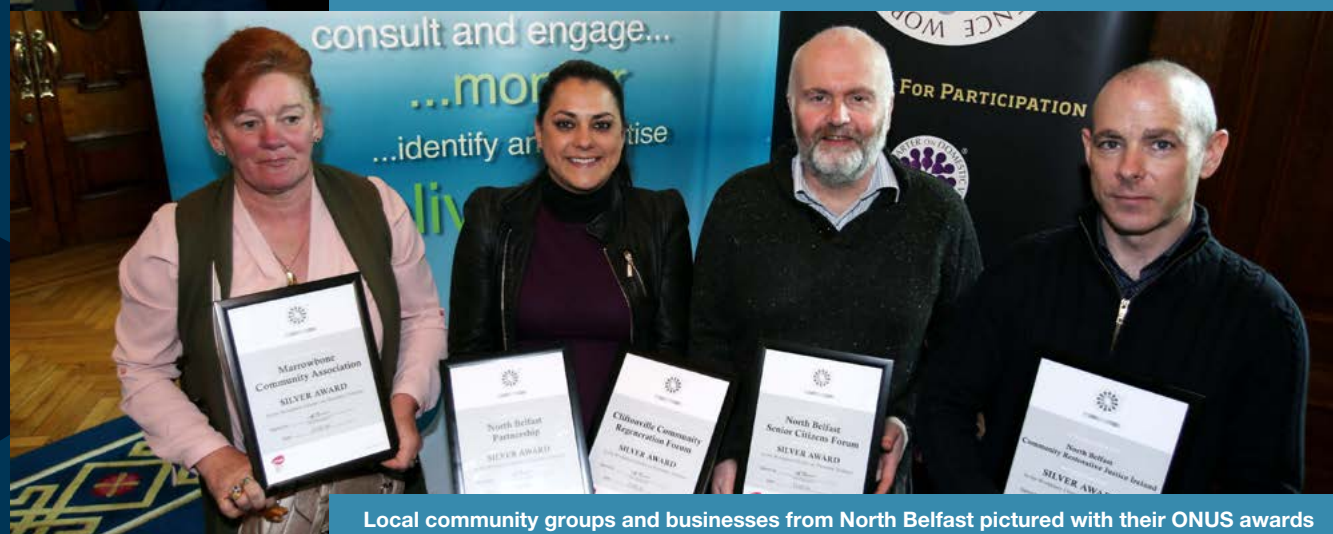
Local community groups and businesses from North Belfast pictured with their ONUS awards