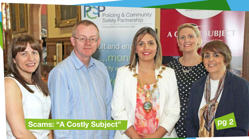
Scams: "A Costly Subject"