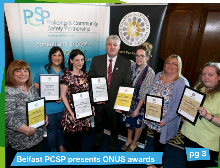
Belfast PCSP presents ONUS awards