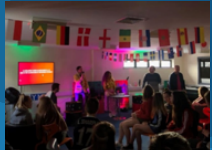
Great atmosphere, great craic, and some great questions