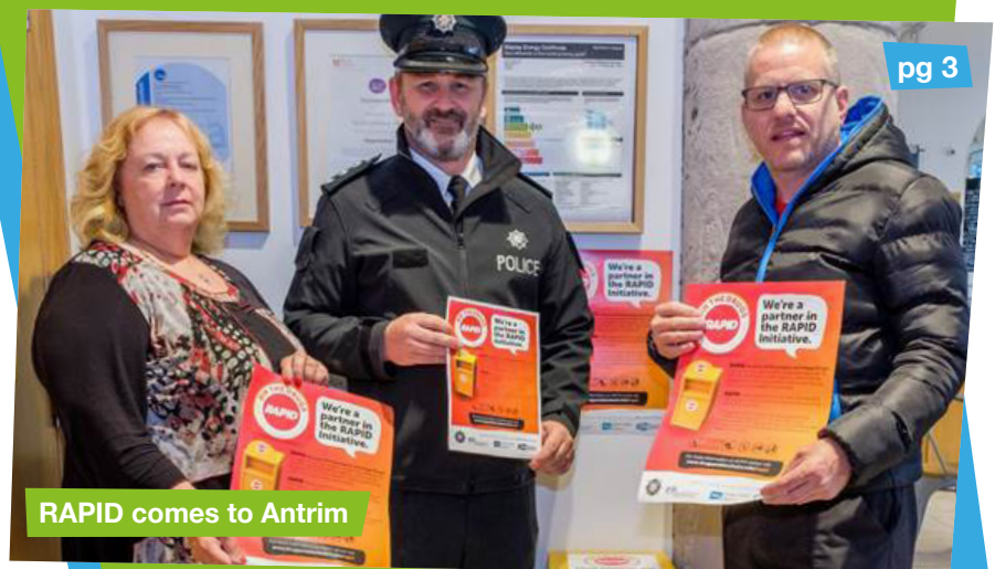
RAPID comes to Antrim