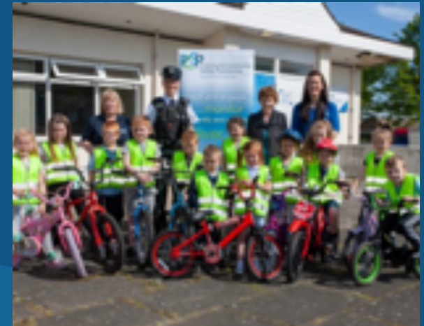
Children from West Winds Play Club in Newtownards attended the first cycle safety workshop