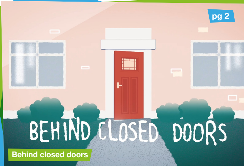
Behind closed doors