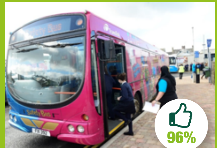
The Translink safety bus made an appearance!