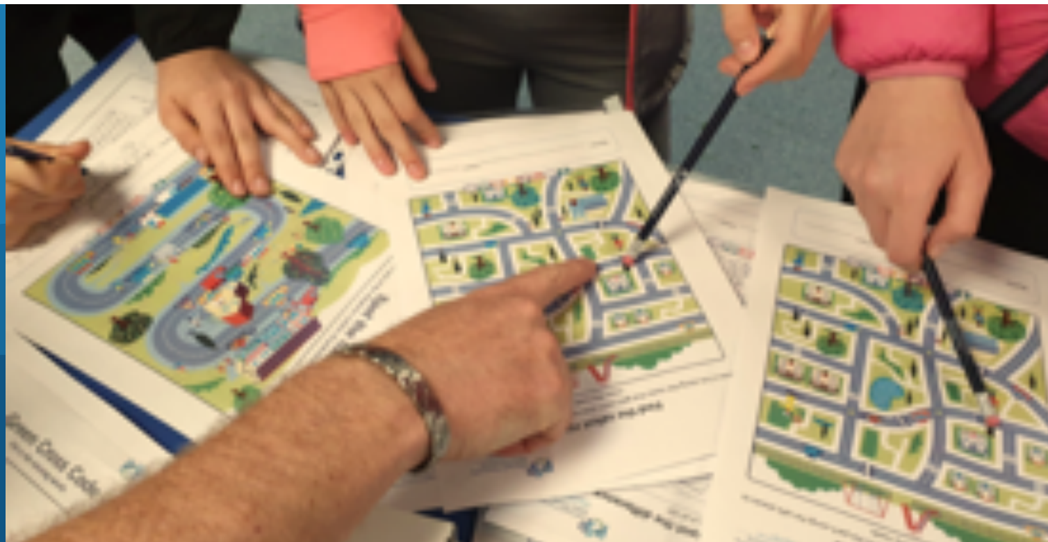
Pupils learned to work out the safest way home and how best to spot dangers on their commute

Armagh Banbridge & Craigavon PCSP has been out and about visiting local primary school Fun Days to engage with the kids and promote safety messages including road safety, stranger danger and internet safety.