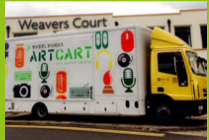
The Art Cart's hitting the road