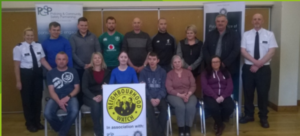
Getting together to watch out for the neighbourhood in Killeter.