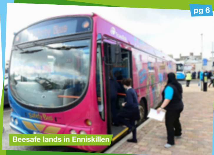
Beesafe lands in Enniskillen