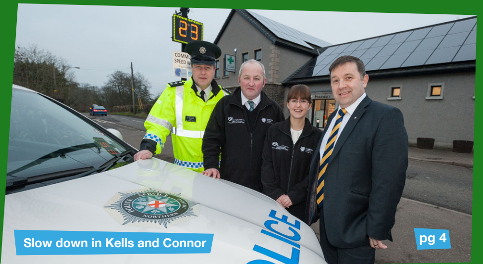
Slow down in Kells and Connor