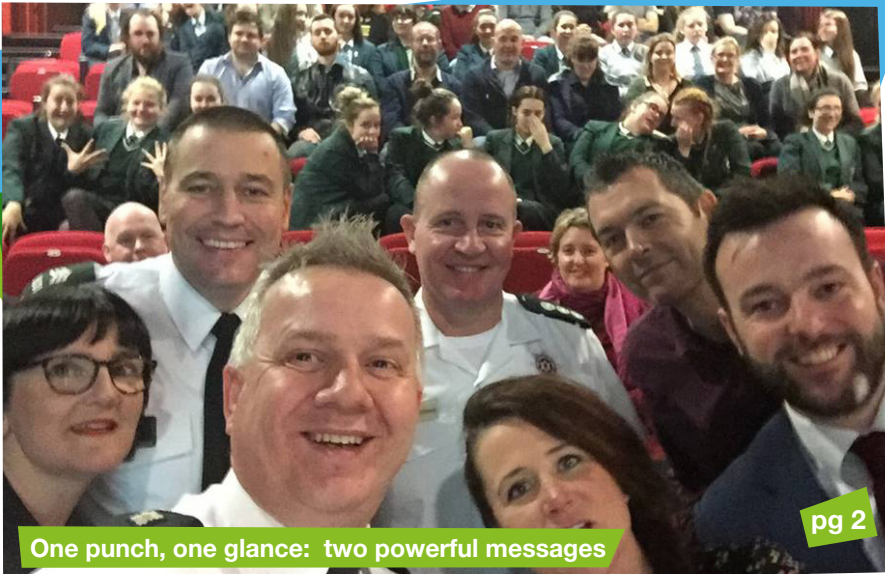
One punch, one glance: two powerful messages