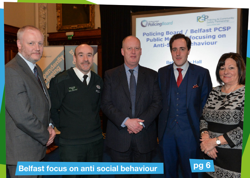
Belfast focus on anti social behaviour