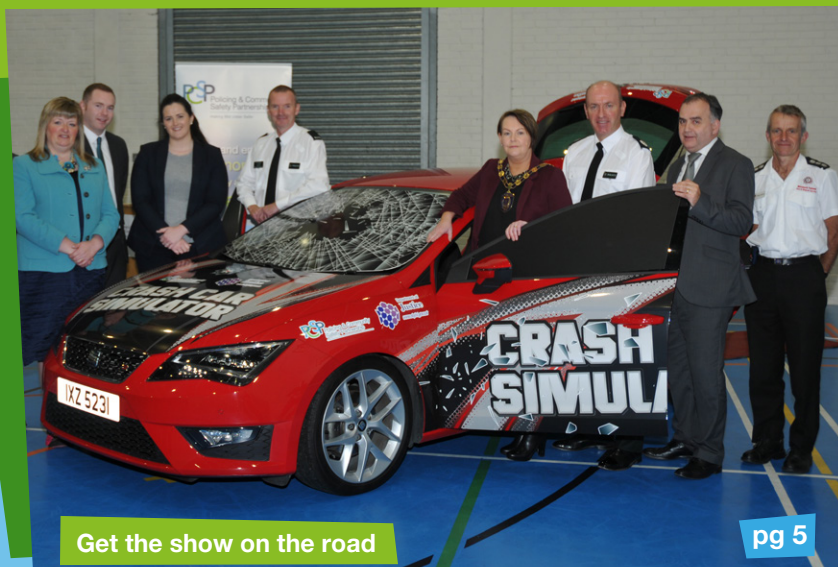
Get the show on the road